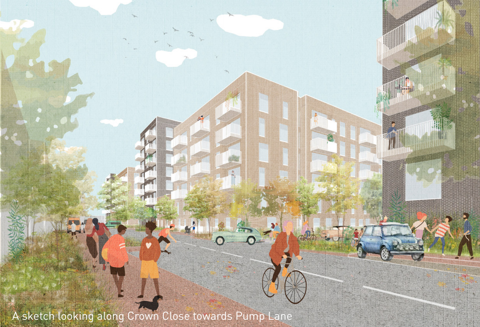
A sketch looking along Crown Close towards Pump Lane

Looking wider, the estate will be designed to have: