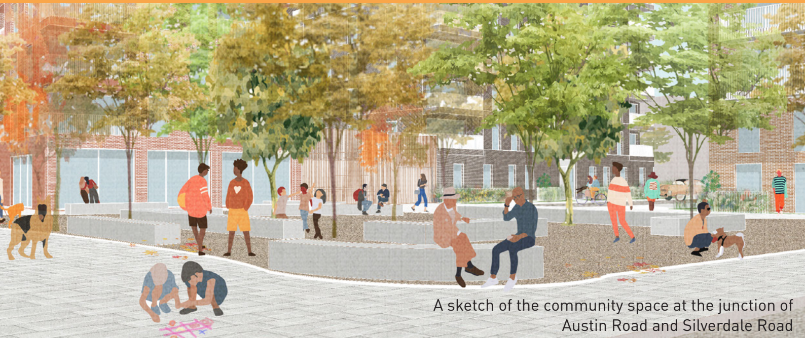
A sketch of the community space at the junction of Austin Road and Silverdale Road